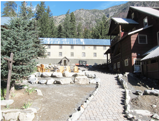
A new walk & meeting area west of hotel at Holden.