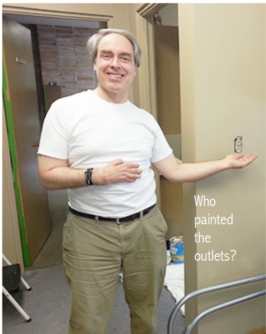
Who painted the outlets?