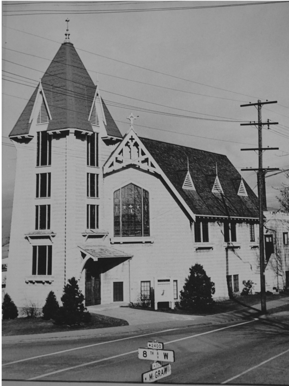
Third Church, completed