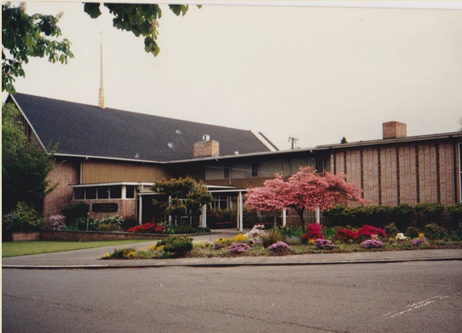
1964 Completion of New Church