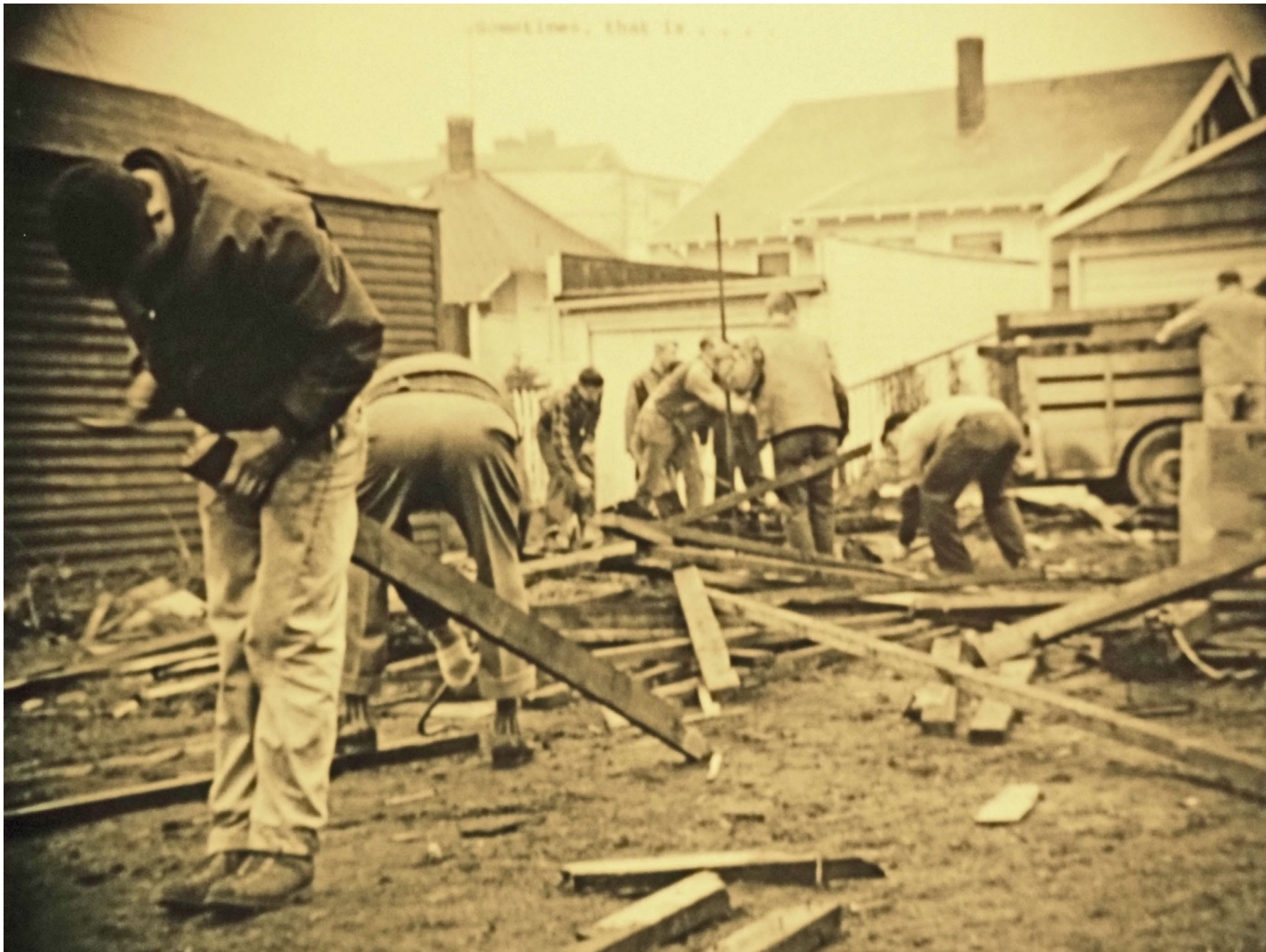
Sunday School Building is Torn Down in 1959