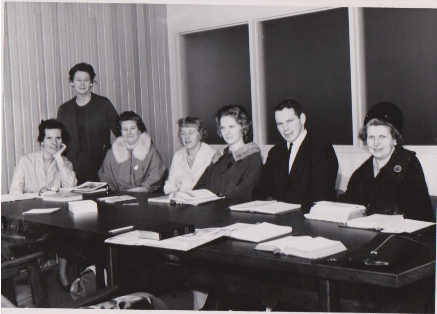
1958 Parents Class