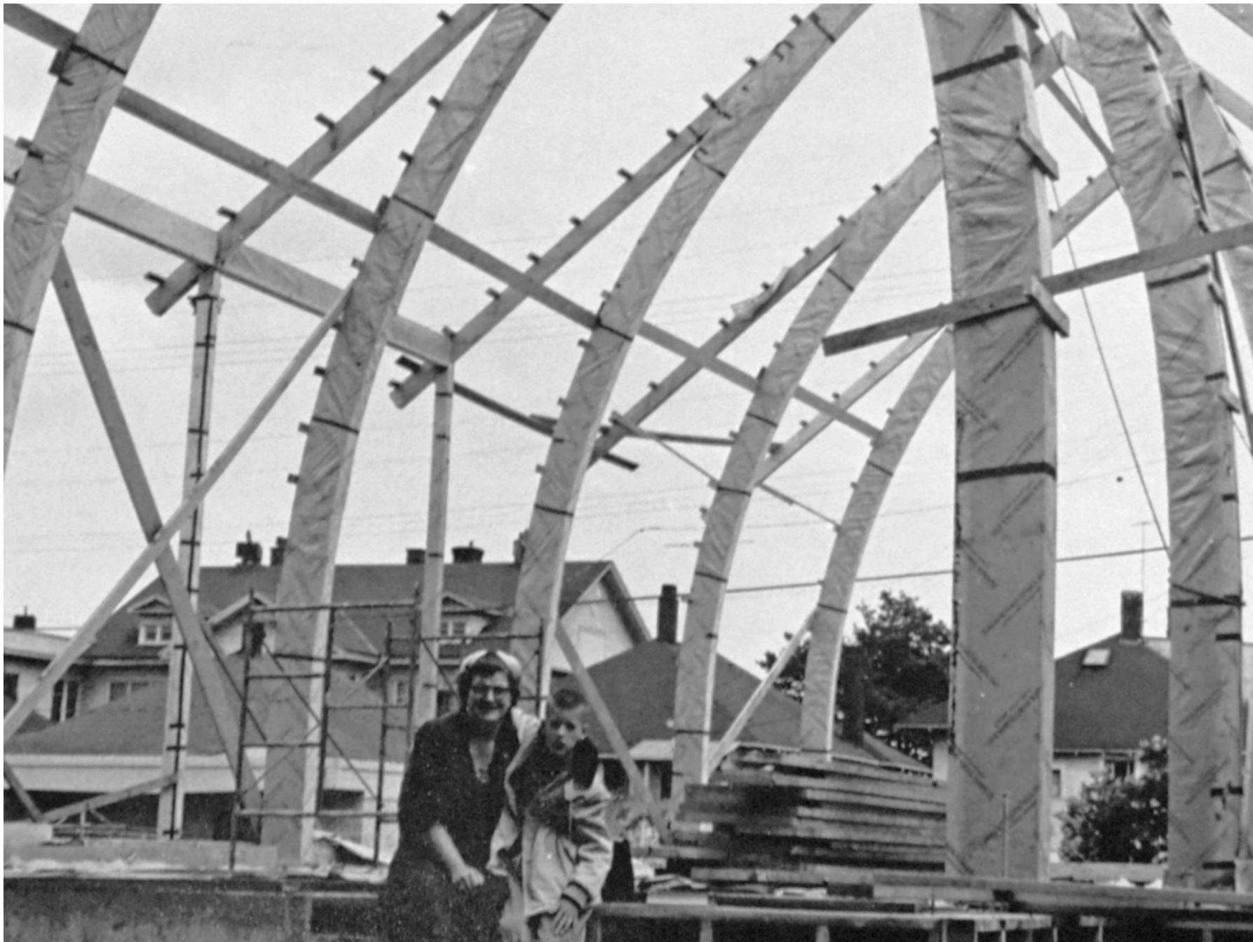
1959 Construction of current nave