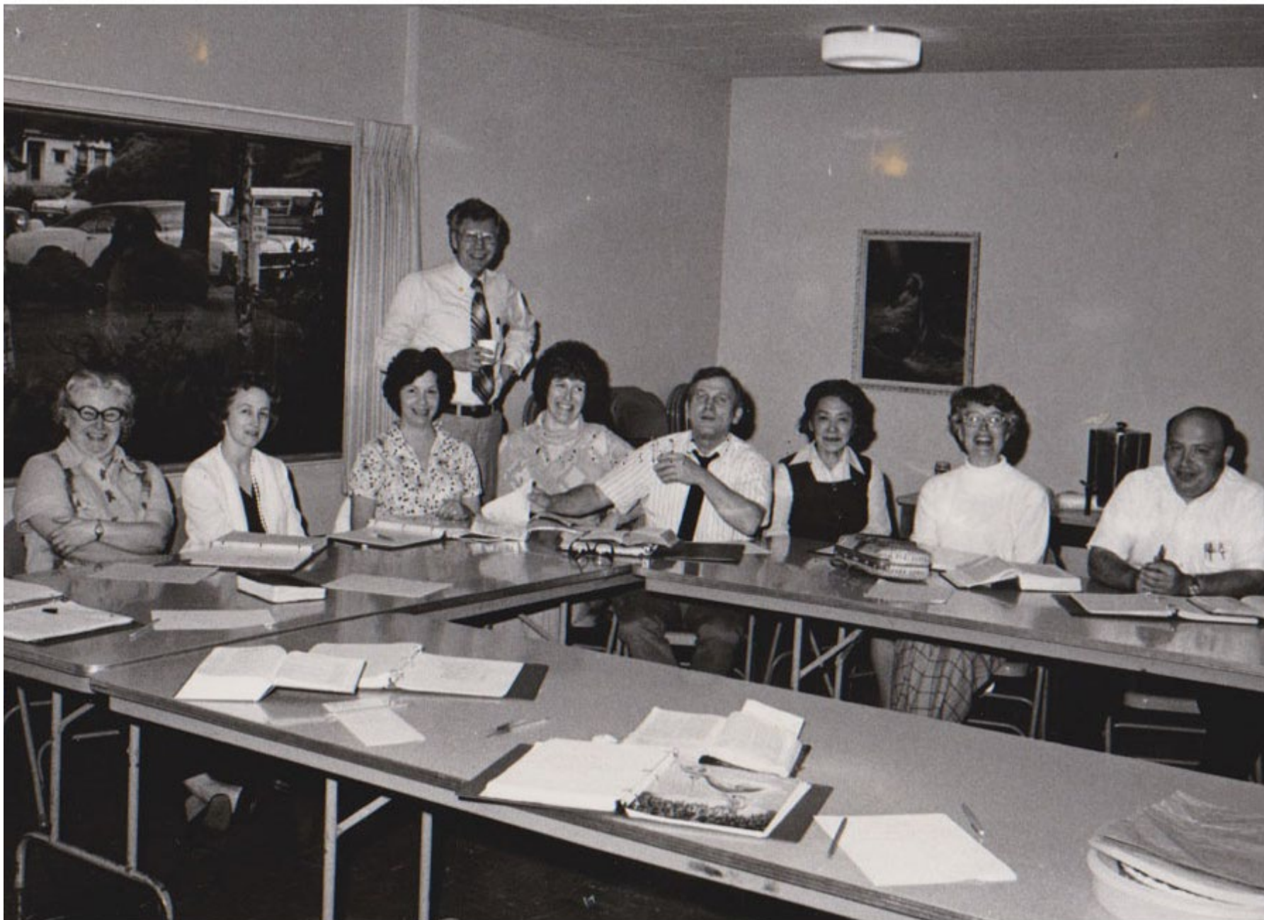
1976 Bethel Bible Study Leaders