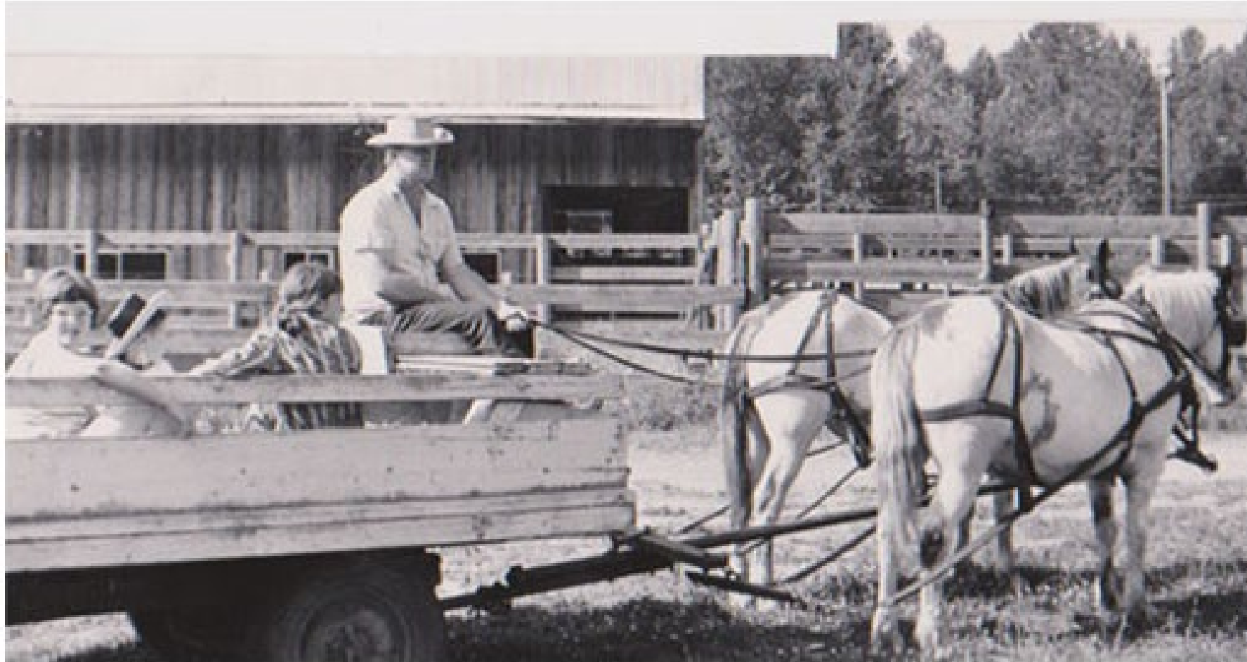
1968 Church Picnic