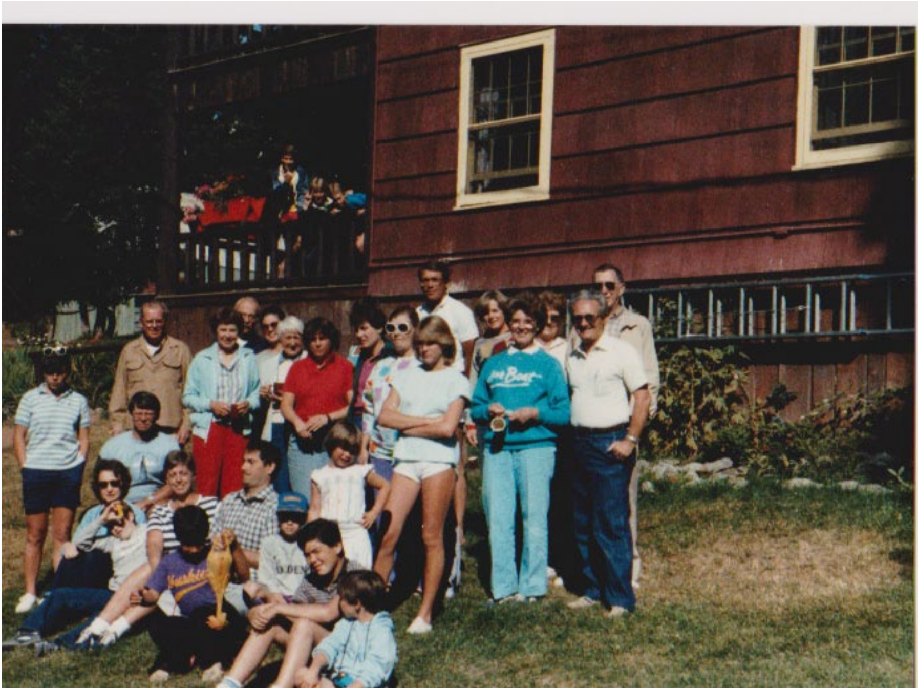
Early 1980's Holden Village