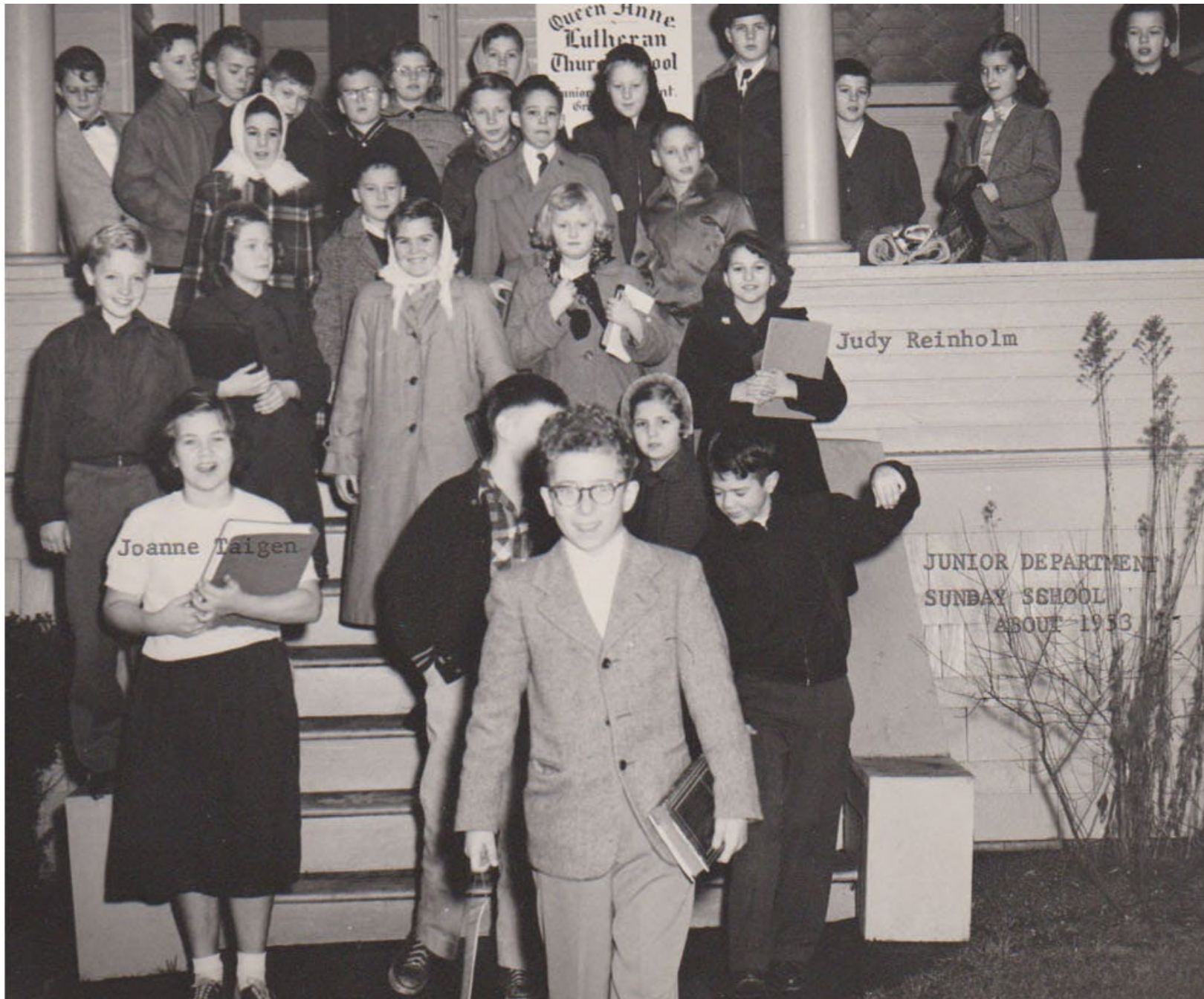
“Junior Department Sunday School Building, about 1953”