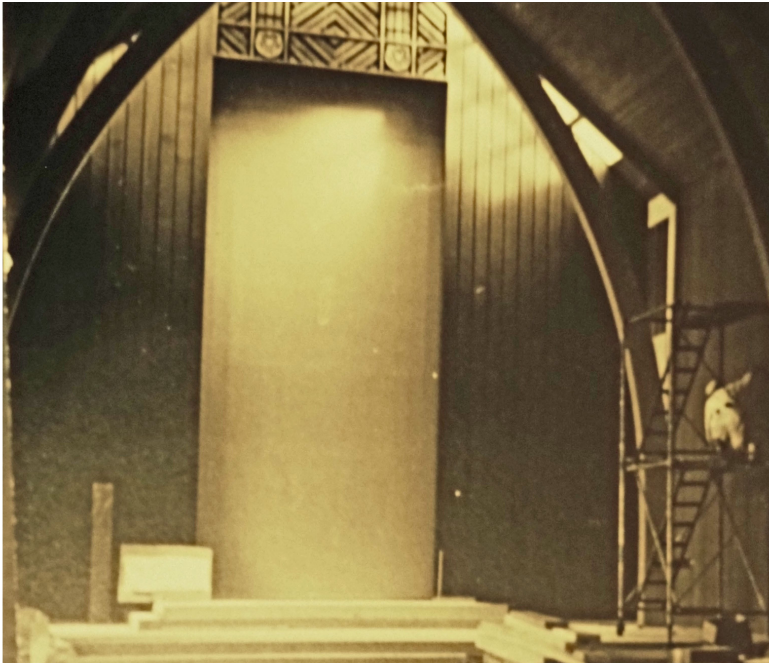
1959 Construction of current chancel