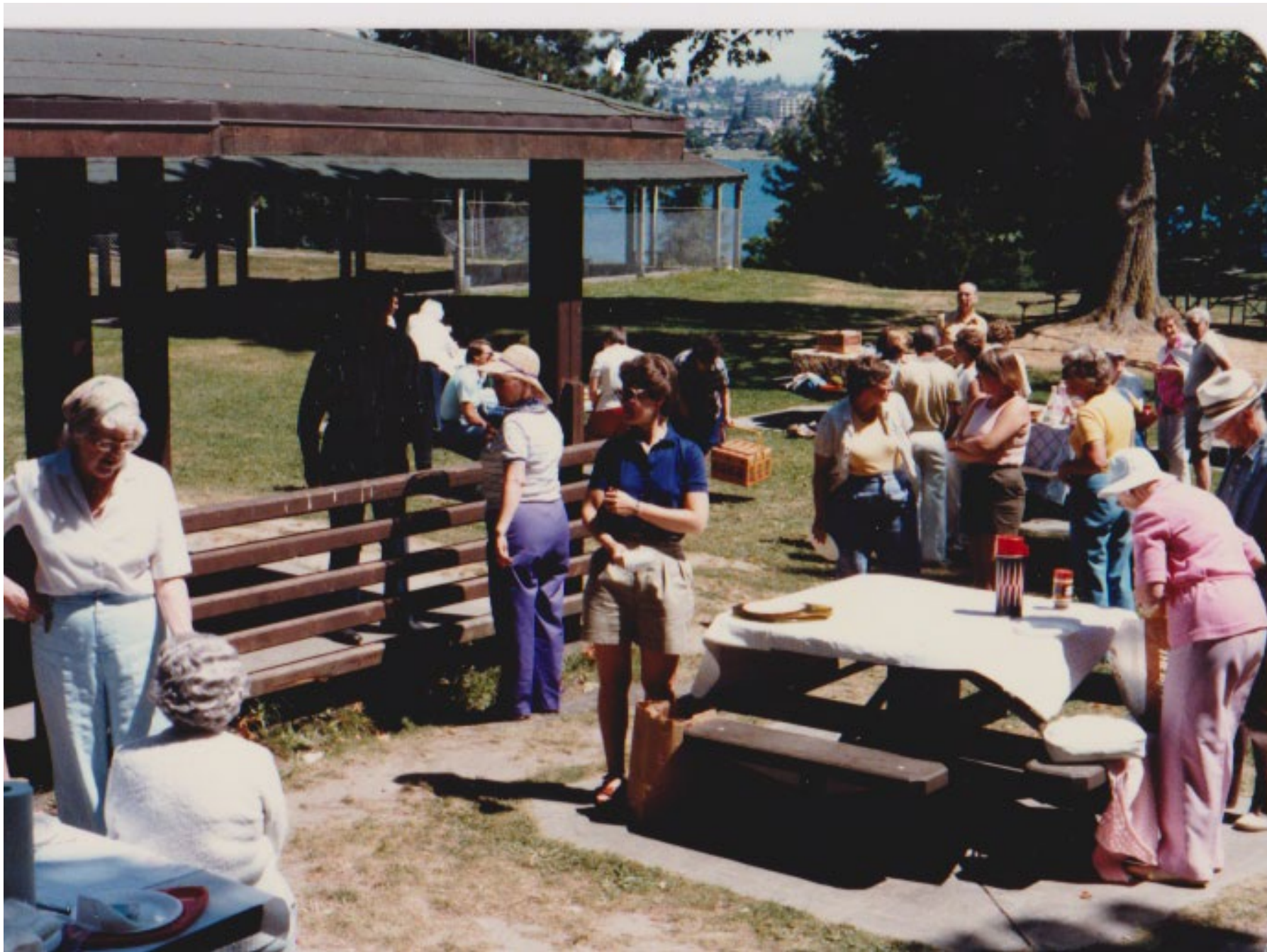
1984 Church Picnic