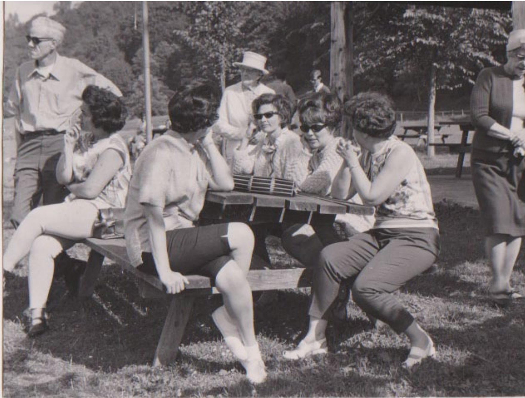
1968 Church Picnic at Aqua Barn