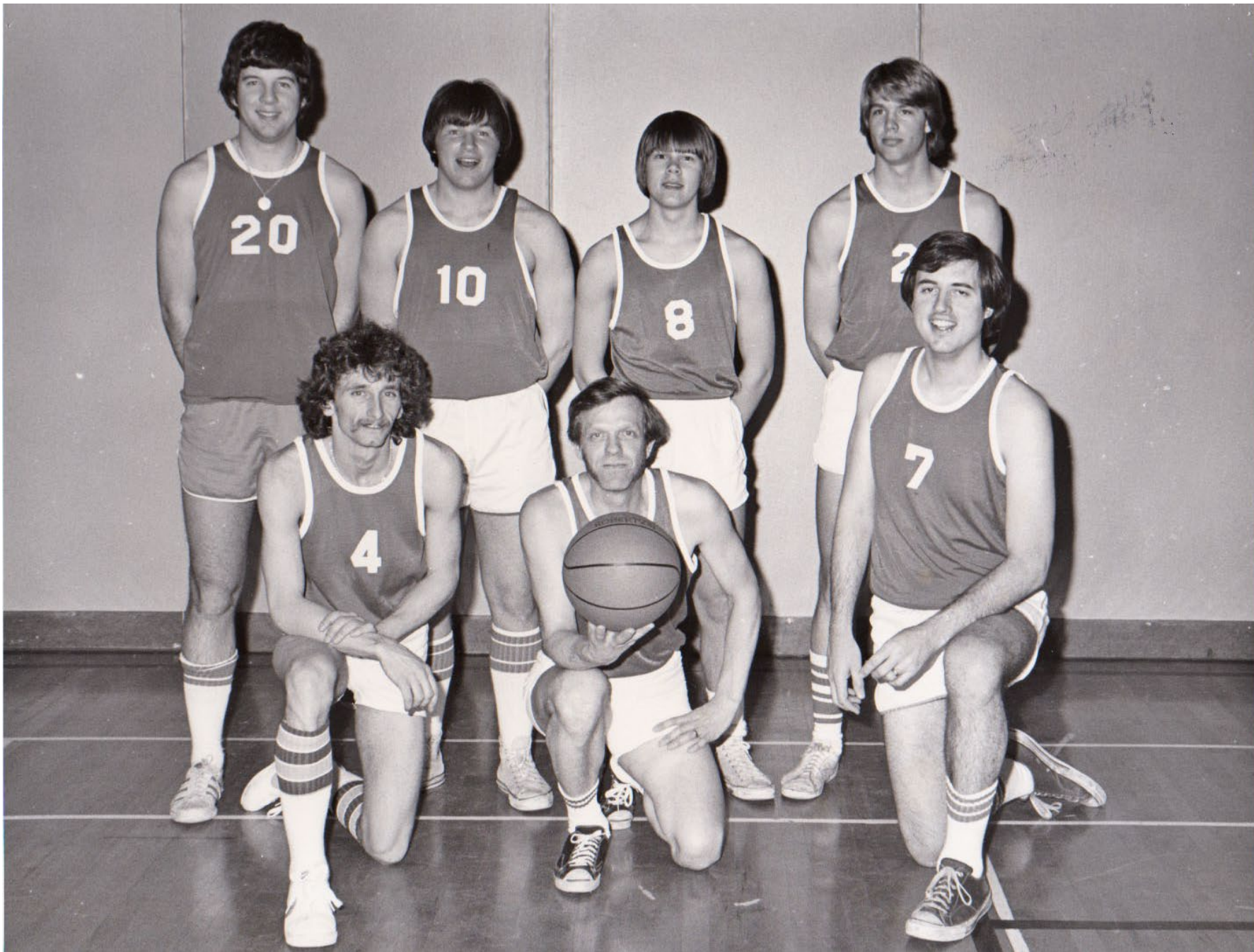
QALC Basketball Team!