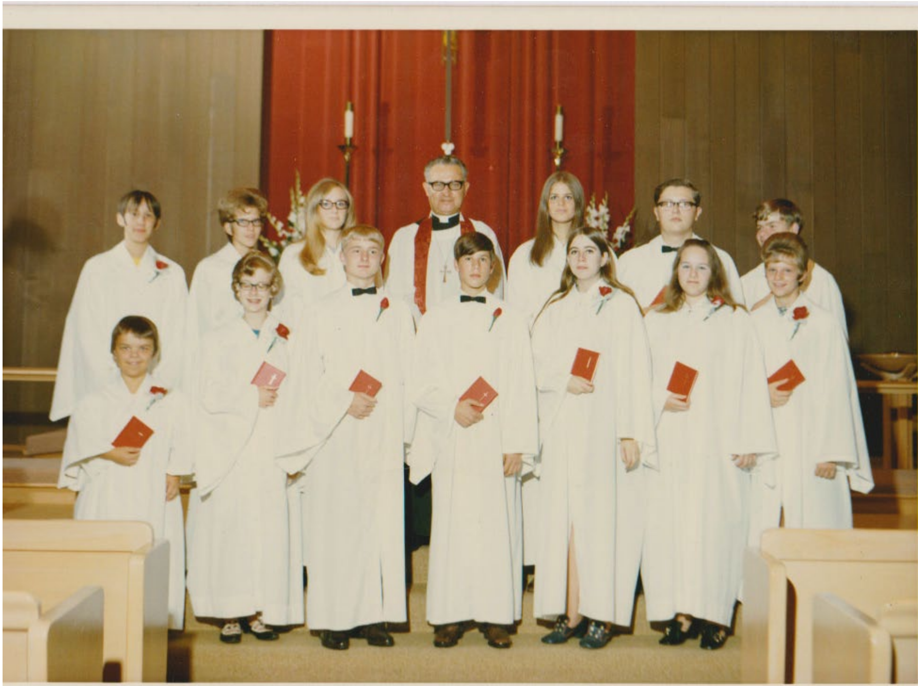
1969 Confirmation Class