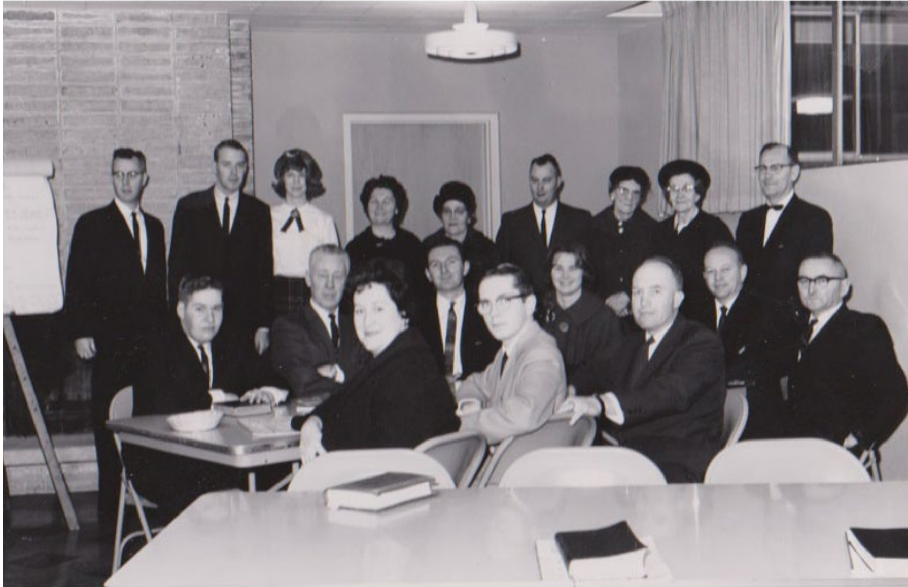
1958 Adult Class