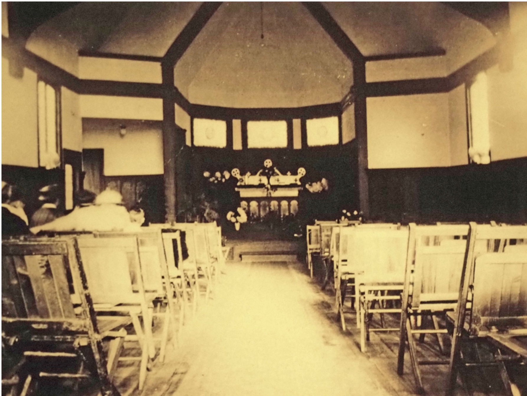
Interior of Third Church with Chairs