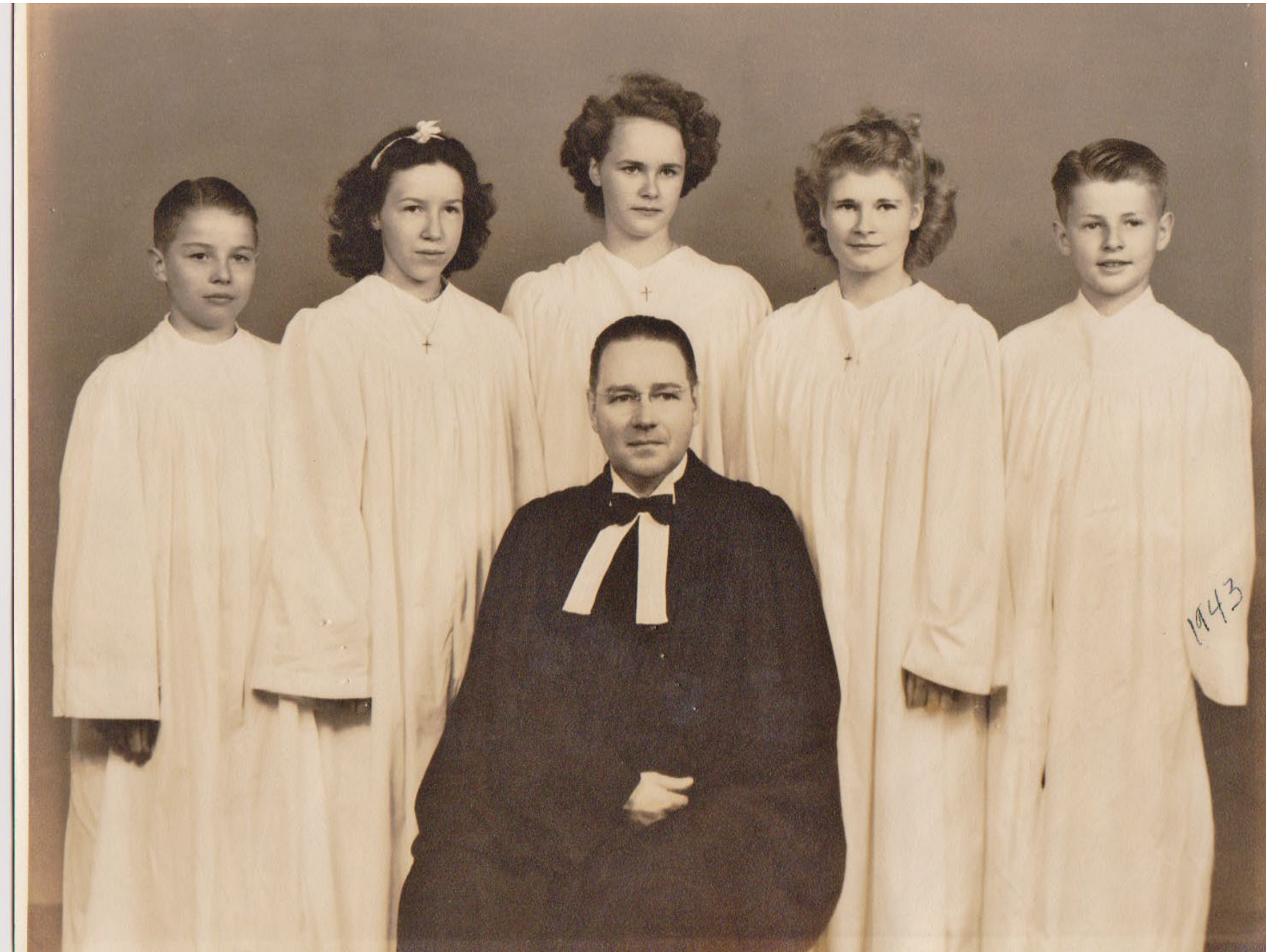
1943 Confirmation Class