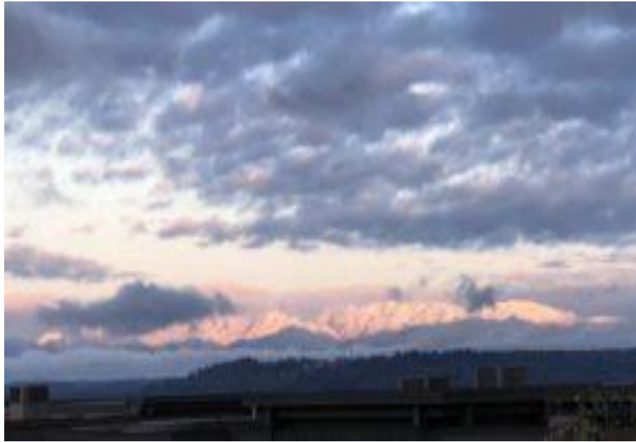
Morning from the beach in Edmonds